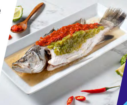
Jiak Modern Tzechar